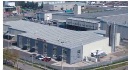
Productions centre for STARstrap™ strapping in Chile