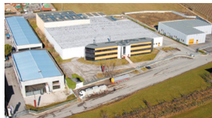
Production centre for machines and equipment in Italy