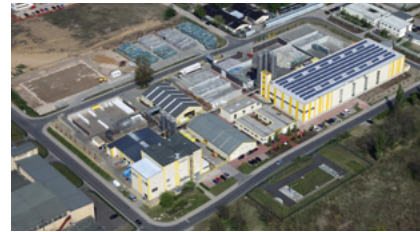
Polyester recycling plant in Germany