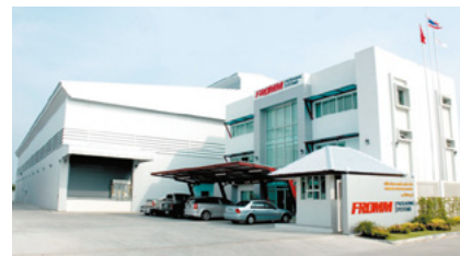
Production centre for STARstrap™ strapping in Thailand