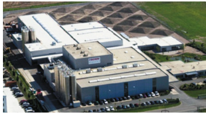
Productions centre for STARstrap™ strapping in Germany