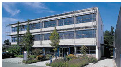
Development centre in Germany